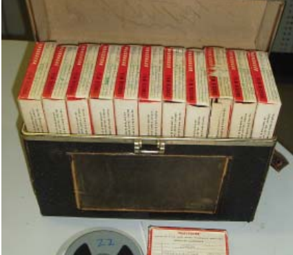
above top: The collection of the information researched by David Neely in preparation for writing In The Rearview Mirror - a history of the Rolls-Royce Owners' Club of Australia